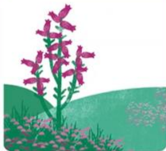
heather in the meadow