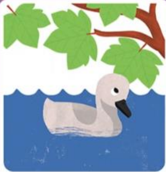
a cygnet under the sycamore