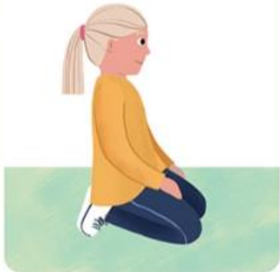
kneel on your knees