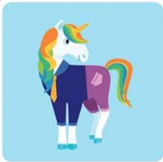
a unicorn in uniform!