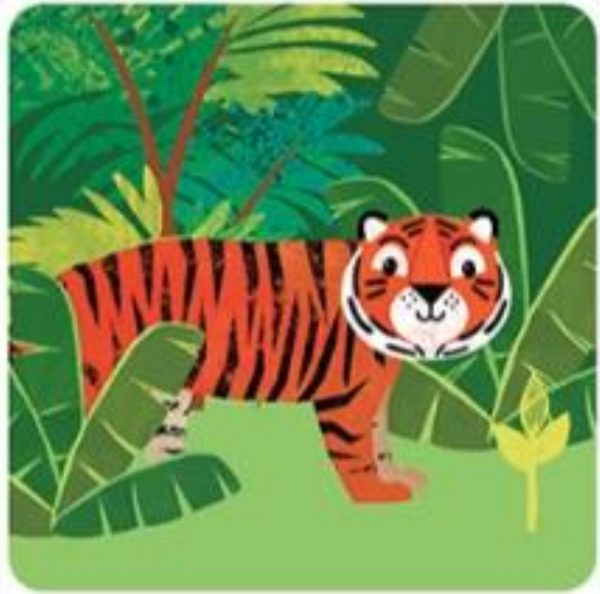
tiger in the wild