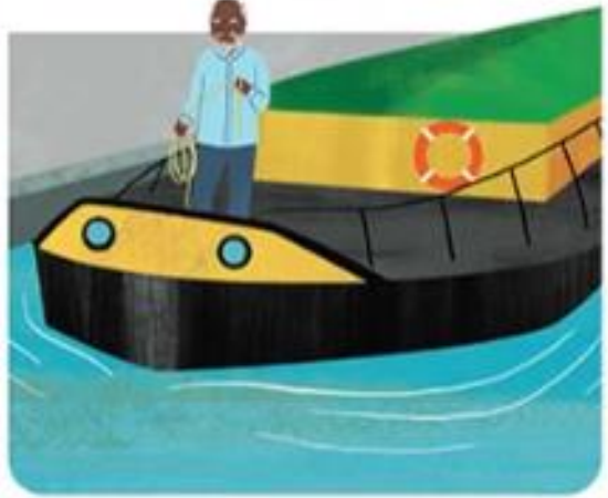
take charge of the barge