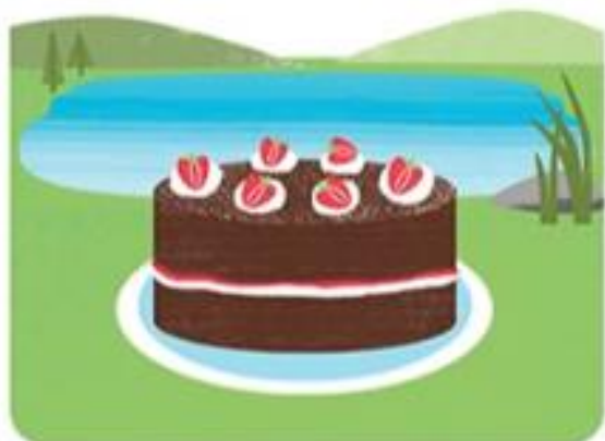
cake by the lake