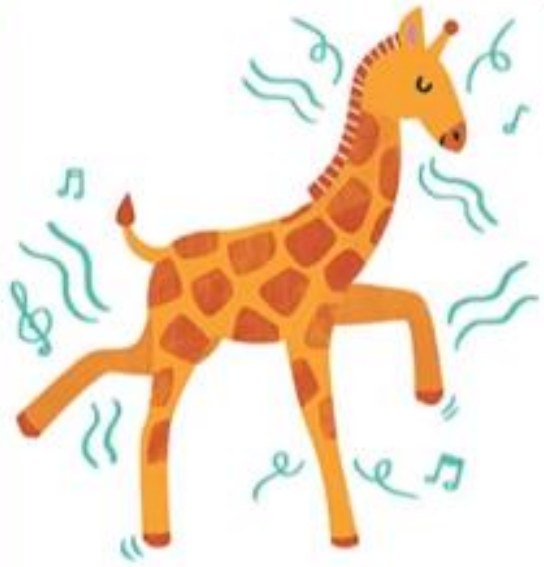
an energetic giraffe