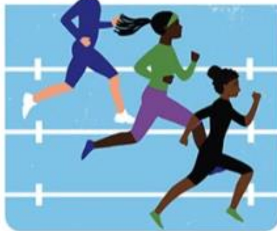
the athletes compete