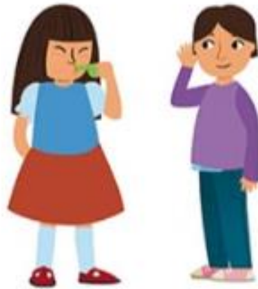
listen to the whistle