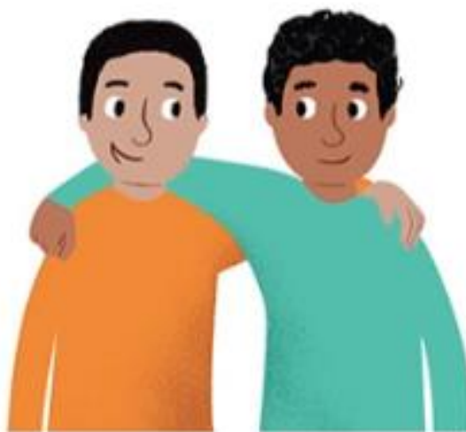
a good friend