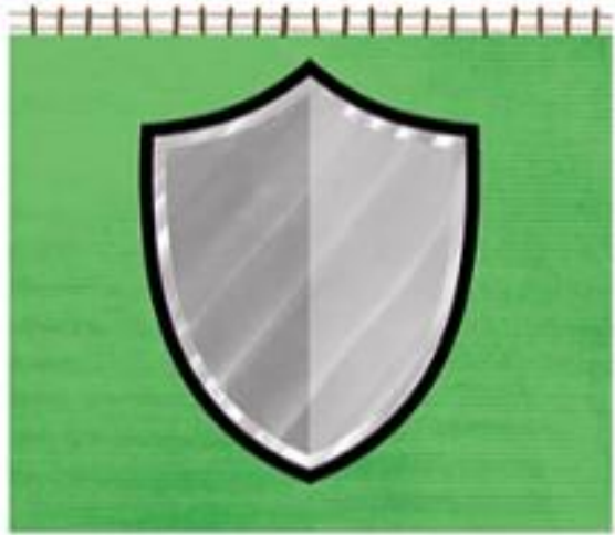
a shield in the field