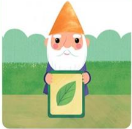
gnome with a sign