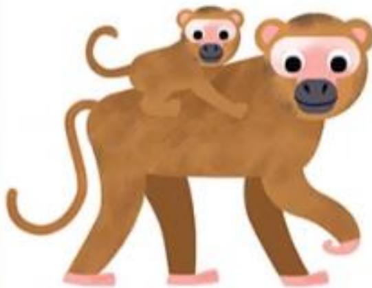
the monkey and his mother