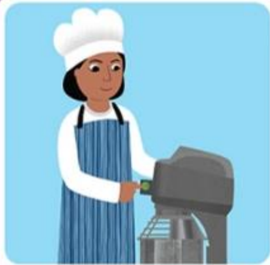
chef has a machine