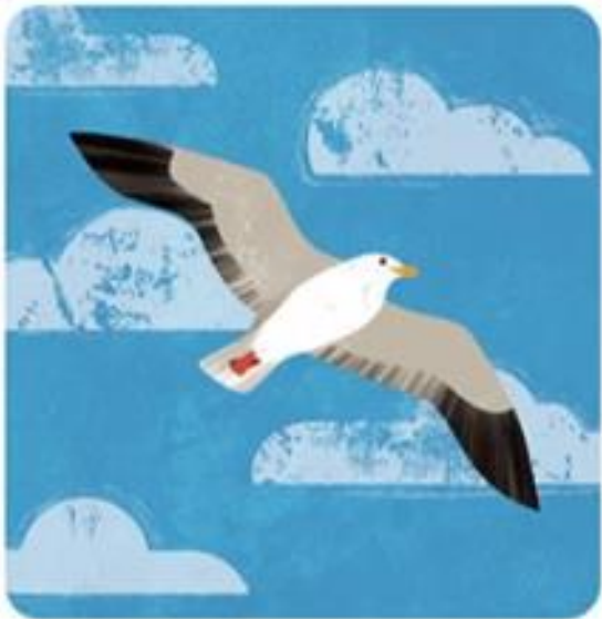
fly in the sky