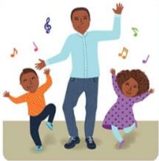
move and groove