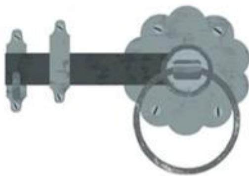
catch on the latch