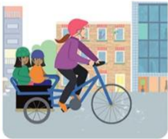
cycle through the city