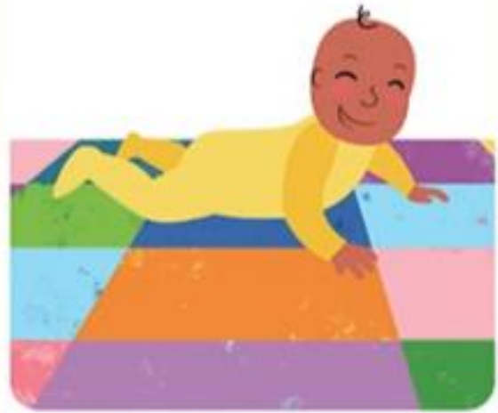
a lovely baby