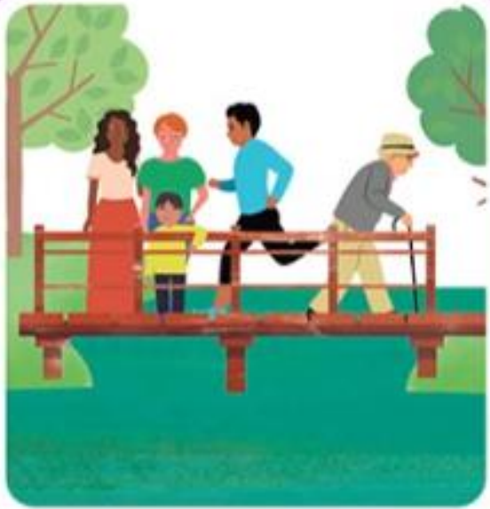
squidge on the bridge