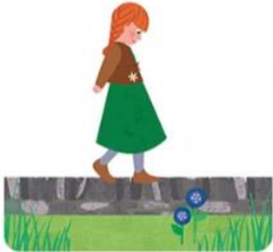
walk along the wall