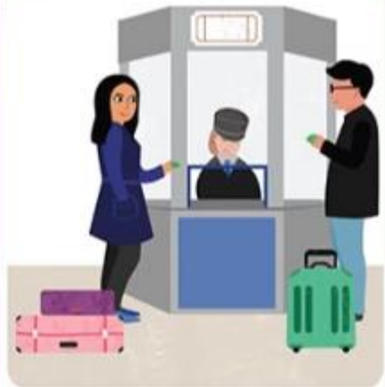
share the fare