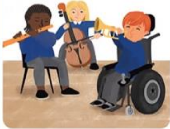
the school orchestra