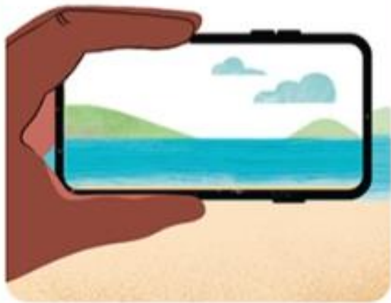
photo on a phone