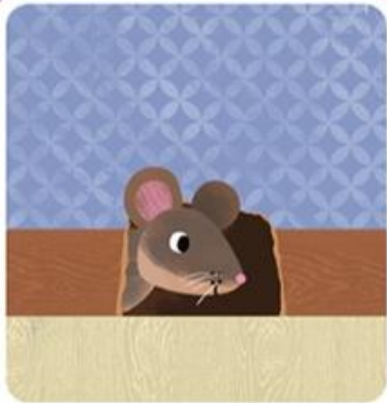
a mouse in the house