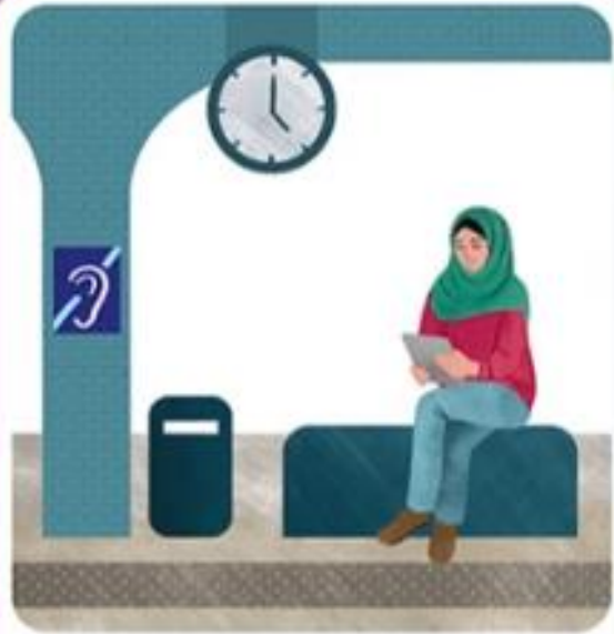
waiting patiently at the station