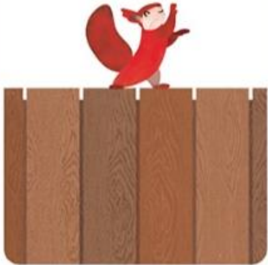
dance on the fence