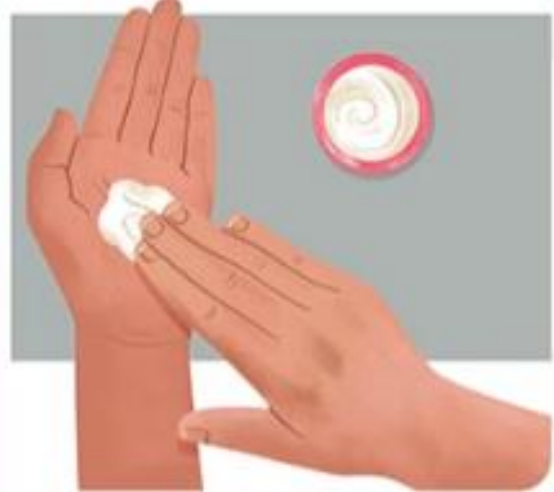
balm on your palm