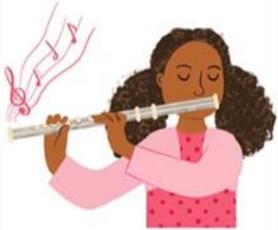
tune on a flute